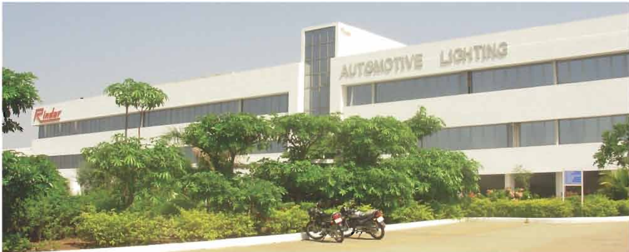
Rinder Chakan facilities

Our main focus is to provide no one quality products to our customer with satisfactory service which is possible with Rinder team. We are there to strive rigorously to satisfy our customer with excellence service and product.