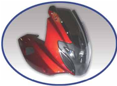
90309.01 complete assembly