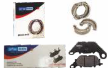
Brake Shoes/Brake Pads